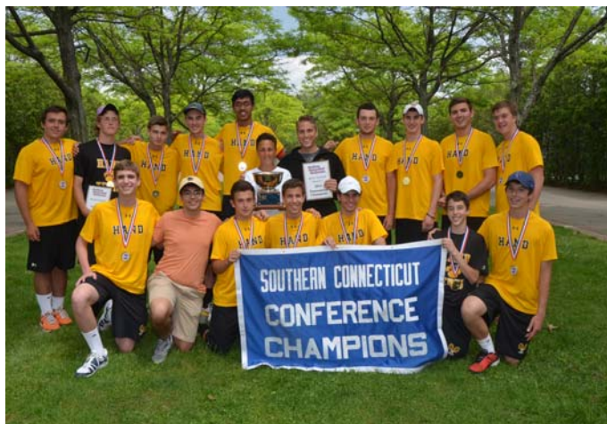
DANIEL HAND WINS SCC AND CLASS L BOYS TENNIS TITLES: After capturing its second straight SCC boys tennis title with an exciting 4-3 win over Amity Regional on May 29, Daniel Hand then went on to capture the Class L state title.

Class MM Boys Cross Country – Guilford Class L Girls Cross Country – Mercy Class LL Girls Swimming – Amity Regional Class L Girls Soccer – Branford – lost to Guilford, 2-0 Class L Field Hockey – Cheshire – lost to Darien, 3-1 Class M Girls Volleyball – Foran – lost to Woodland, 3-1 (25-15, 25-23, 23-25, 25-15) Class LL Football – Fairfield Prep – lost to Southington, 52-34