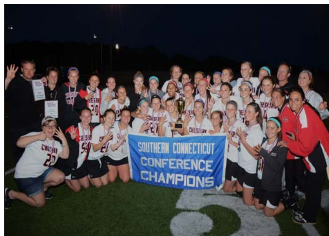
RAMS FOUR-PEAT! Cheshire captured its fourth straight SCC girls lacrosse playoff title. The Rams went on to reach the semifinals in the Class L playoffs.