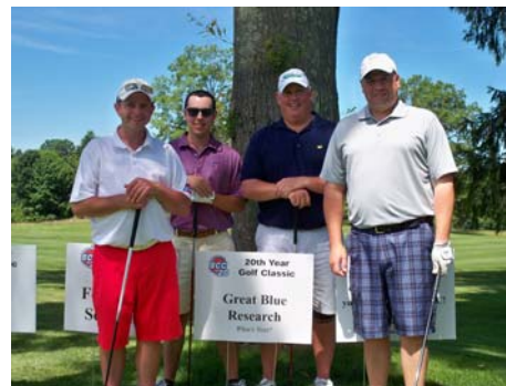
The foursome from SCC corporate sponsor Great Blue Research (photo by Al Carbone).

Cheshire High School Athletic Booster Club