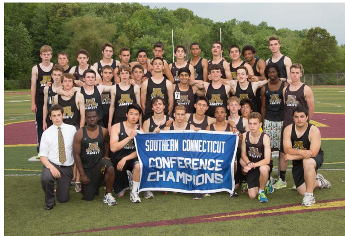
SPARTANS THREE-PEAT! Amity Regional captured its third straight SCC boys outdoor track & field championship – and its ninth overall.

Championship Match – May 30 @Yale University