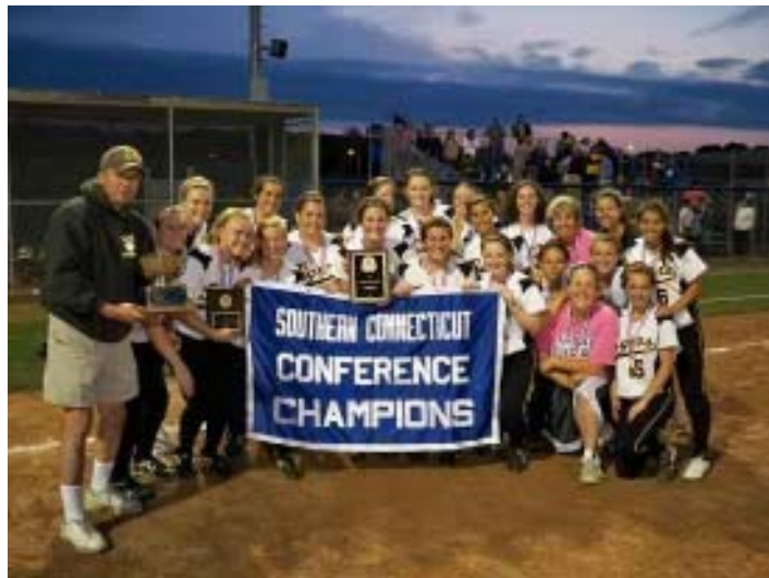
Hand won its first SCC softball title since 1999

SCC Playoffs: Top-seeded Xavier defeated #2 Cheshire, 3-2 (25-20, 25-17, 17-25, 17-25, 15-8) in the championship match on May 27 at Amity Regional High School.