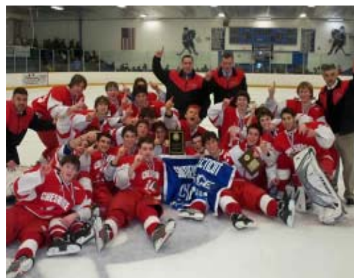
Cheshire - 2010 SCC Division II ice hockey champions