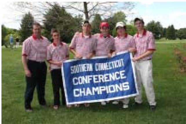
Fairfield Prep captured its fourth straight SCC golf championship.

SCC Championship (May 22 @Amity HS): 1. Amity, 100.50; 2. Xavier, 97.50; 3. Hamden, 73; 4. Notre Dame, 50; 5. Hand, 48; 6. Jonathan Law, 40.50; 7. Wilbur Cross, 35.50; 8. Fairfield Prep, 32; 9. Hillhouse, 31; 10. Lyman Hall, 30; 10. Shelton, 30; 12. Branford, 25.50; 13. East Haven, 22; 14. Cheshire, 20.50; 15. Career, 20; 16. North Haven, 16; 16. Sheehan, 16; 18. West Haven, 9; 19. Guilford, 4