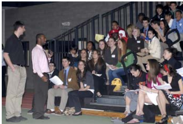
The SCC Spring Captains Council event was held at a new location - the New Haven Athletic Center - on Monday, March 24.

Plans are already underway for the 2008-09 sessions.